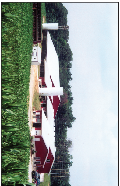
- Burklea Farms Franklin County, PA