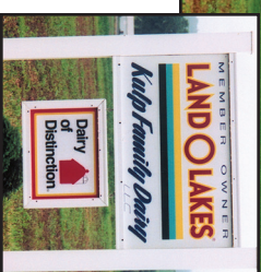
- Hersmen Kulp Family Dairy Blair County, PA

“One hour after the first use with George II, we saw that the feet were more colored and the cows showed signs of the copper sulfate burning the feet more. We have cut back from running the foot bath 7 times to 3 times a week with good results!”